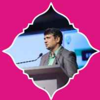
B2B sector presentation and roundtable meetings