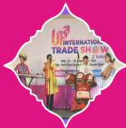
Vietnam - Partner Country