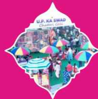
UP Ka Swad (Cuisine and Culinary Arts)