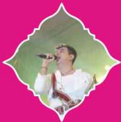
Cultural Performances (Folk & Classical)