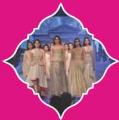
Fashion Shows and Band Performances