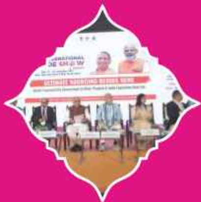
Knowledge Sessions, Seminars, Conclaves