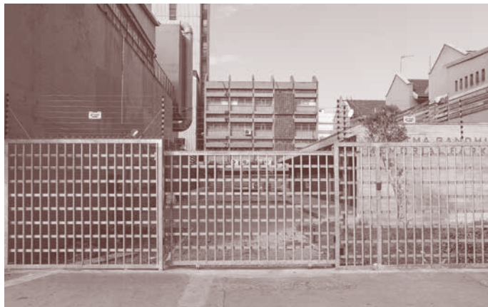
95 Dr Goonam Street is where the building purchased by Gandhi on behalf of the Natal Indian Congress around 1897 was demolished. The site is administered by the Mahatma Gandhi Memorial Trust, created by the NIC in 1953. The site has recently been developed by the Trust as the Mahatma Gandhi Memorial for use by all as a public space