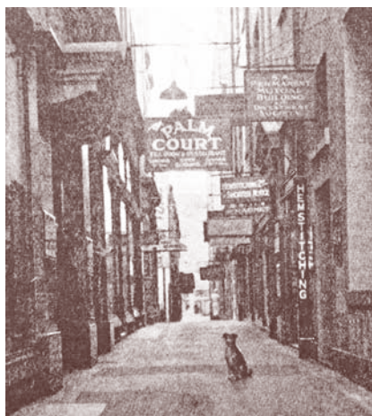
Mercury Lane off Dr Pixley kaSeme Street (West St). The Natal Mercury publishing offices were on the left and Gandhi's legal office on the right

[General Borough Rate, August 1899 – July 1900]