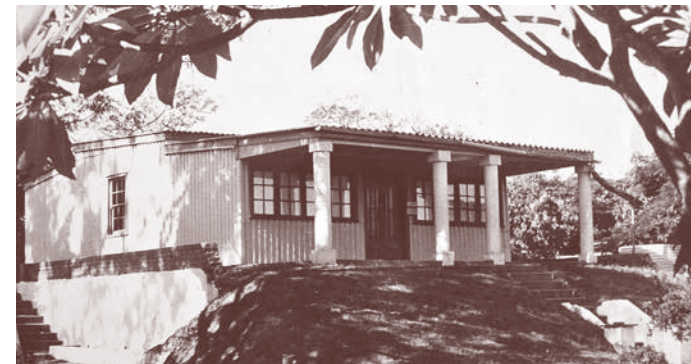
Sarvodaya in the 1930s. The corrugated iron sheets were later replaced by asbestos sheeting

significance, as the legend goes, is that the bird phoenix comes back to life again and again from its own ashes, i.e. it never dies. The name Phoenix, for the present serves the purpose quite well, for we believe the aims of Phoenix will not vanish even when we are turned to dust."