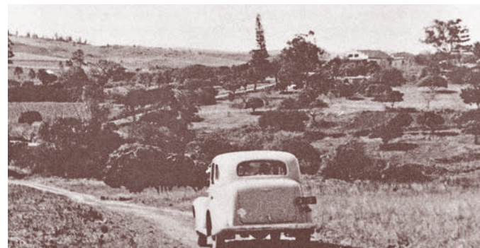
The roadway into Phoenix Settlement in the 1930s