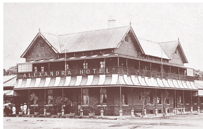
The Alexandria Hotel circa 1890s, at the Bay end of Mahatma Gandhi Road (Point Rd), marks a nearby site where a crowd of white artisans gathered in January 1897 to prevent the Indian passengers of the Courland and Naderi from disembarking