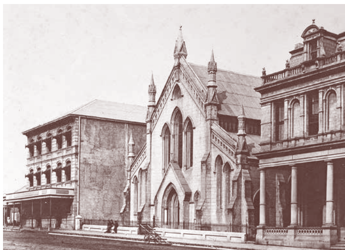
West Street south side, Gardner and Mercury Lane circa 1900