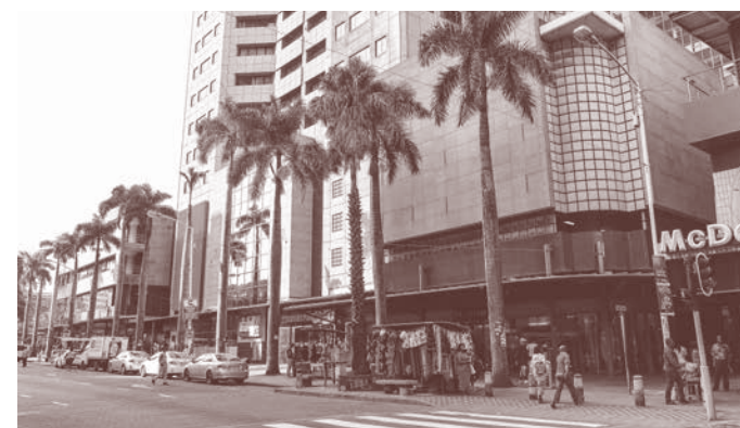
The site of the Wesleyan Church in Dr Pixley kaSeme Street today, looking east towards Dorothy Nyembe Street with Mercury Lane to the right