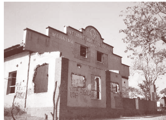
in 1985, during unrest in the Inanda area Phoenix Settlement was looted and torched