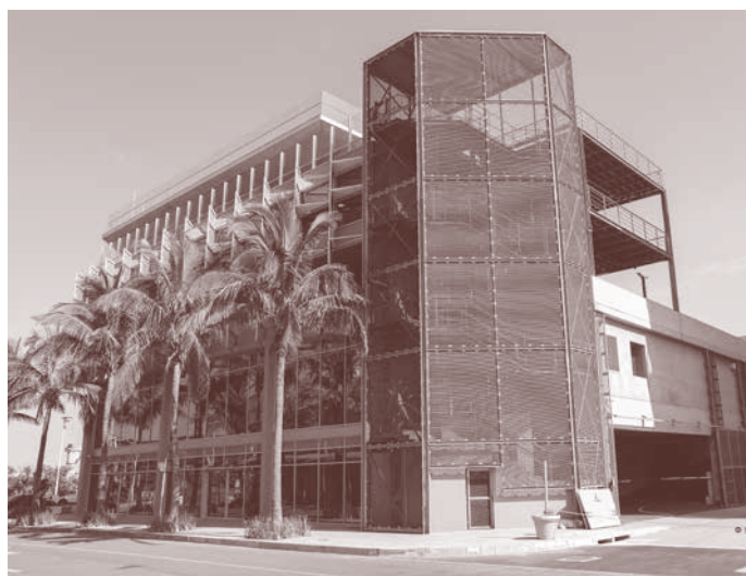
The site today of the anti-Indian demonstration of 13 January 1897 located at the Point on the corner of Signal Road off Mahatma Gandhi Road (Point Rd)