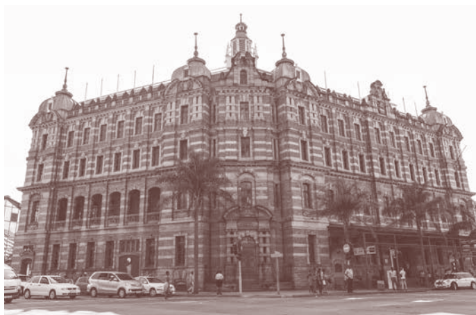
The old Durban Railway Station on the corner of Monty Naicker Road and Soldiers Way as it stands today. Two floors were added to the building in 1904. When the station moved to a new location in Umgeni Road, the building was retained and converted to offices

It was from Durban Station that Gandhi embarked on the fateful train journey that, in later years, he regarded as having changed the course of his life. He boarded a train at the Durban Station on 7 June 1893 in order to travel to Pretoria, where he was due to meet with Dada Abdullah's legal advisers. A first class seat was booked for him. The train reached Pietermaritzburg Station at about 9pm. A white passenger entering the compartment was disturbed to see it occupied by a 'person of colour' and returned with two officials who ordered Gandhi to move to the van compartment. Gandhi protested that he had a first class ticket and was therefore entitled to be in that compartment. A white constable was called, who took Gandhi by the hand and pushed him out of the train. His luggage was also taken out and the train continued without him. Gandhi spent the night in the waiting room. While he had his hand-bag with him the railway authorities had taken charge of the