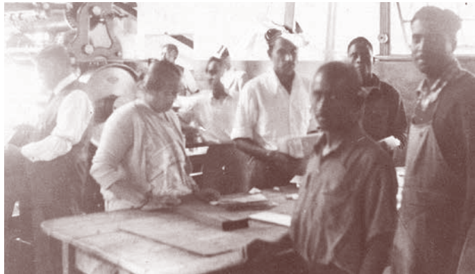
Phoenix Settlement printing works where members hand printed the Indian Opinion

The plots at Phoenix Settlement were not fenced in and, instead, narrow paths and roads divided one building from another. Settlers constructed houses of corrugated iron. Within two or three months the settlers had built eight houses of corrugated iron with rough wooden supports. Gandhi's house, Sarvodaya , consisted of one big room which served as a living and dining room, two small bedrooms, a small kitchen and a rough bathroom. A hole was cut in the iron roof of the bathroom and a shower set up by balancing a garden watering can on a piece of wood; attached to the can was a piece of cord which was used to tip the water out of the can. Each house had its own little toilet where a bucket system was installed and each householder was responsible for the emptying of the bucket at a site set aside for that purpose. Apart from printing and agriculture, education became a vital service at Phoenix Settlement and a boarding school was later established with the help of Dr Pranjivan Mehta, Gandhi's friend from his student days in London.