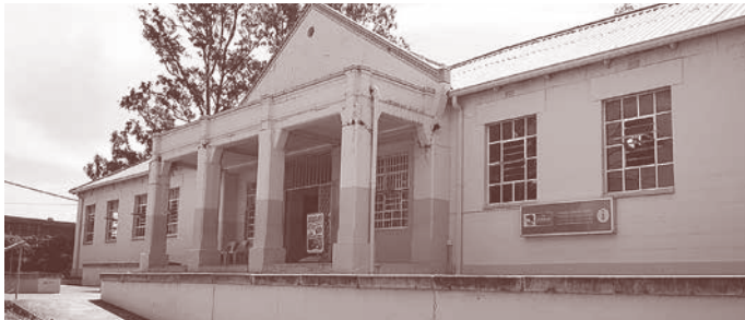
Ohlange Institute in Inanda, established by Dr John Langalibalele Dube in 1901