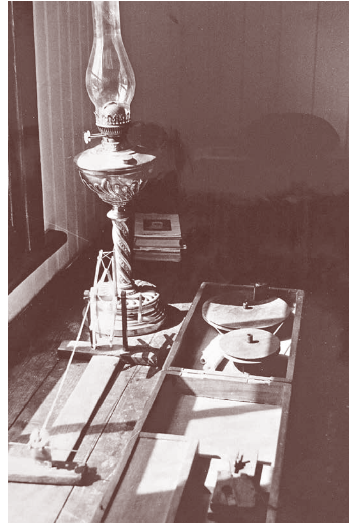
Gandhi ephemera in the library and museum at Phoenix Settlement

On 9 July 1914 Gandhi attended a farewell function organised by the Gujerati Sabha at the Surat Hindu Association Dharmashala in Victoria Street, since renamed Bertha Mkhize Street. On the same day he also spoke at a children's sports function organised by the Farewell Committee in Albert Park. A public dinner held in honour of Gandhi in Durban, on 11 July 1914, was attended by the Mayor and other prominent whites and about 30 Indians. Addresses were