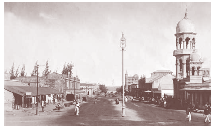
Dr Yusuf Dadoo Street (Grey St) circa 1890s