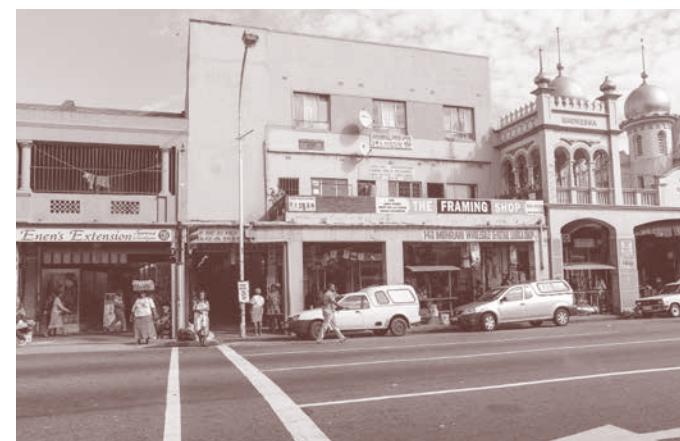
The building at the corner of Dr Yusuf Dadoo Street (Grey St) and Dr A B Xuma Street (Commercial Rd) is where the Congress Hall was located. It was here that the Natal Indian Congress held its meetings and other events