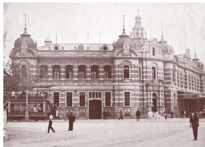
Durban Railway Station circa 1890s. It was from here that Gandhi departed on his journey to Pretoria on 7 June 1893