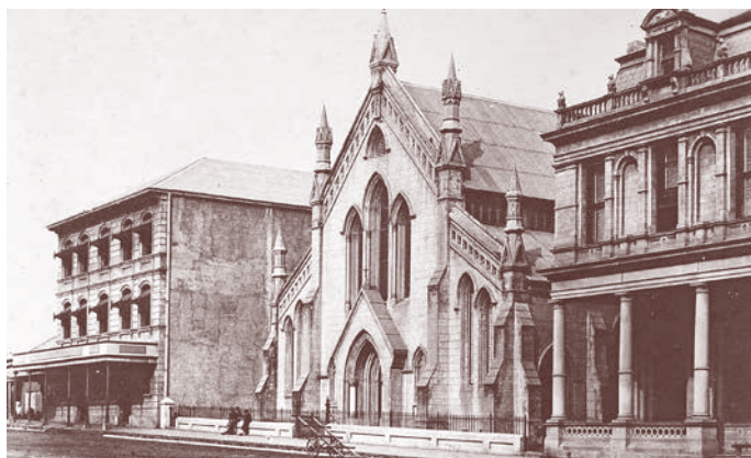
The Wesleyan Church in Dr Pixley kaSeme Street (West St) between Dorothy Nyembe Street (Gardener St) and Mercury Lane was demolished in 1968 and a new Central Methodist Church erected in Samora Machel Street (Aliwal St)