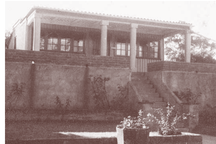
Sarvodaya , Gandhi's corrugated iron cottage at Phoenix Settlement

"Phoenix is a very good word which has come to us without any effort on our part. Being an English word, it serves to pay homage to the land in which we live. Moreover, it is neutral. Its