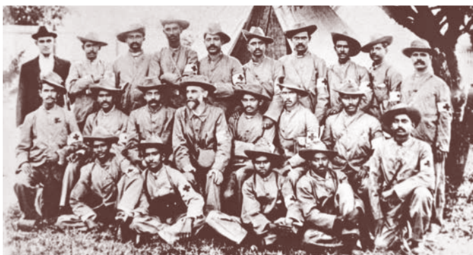
Indian Volunteer Ambulance corps Stretcher Bearers, South African War, Gandhi seated centre in the second row

carpenters and masons who had worked with Gandhi in the Indian Stretcher Bearer Corps during the South African War, a shed was erected for the press. The shed was ready in less than a month. At first the settlers lived under canvas while erecting dwellings on the property. Gandhi described the place as being uninhabited, thickly overgrown with grass, infested with snakes and dangerous to live in. However the settlers were undaunted.