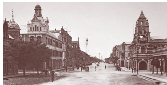
Anton Lembede Street (Smith St) looking west circa 1890s