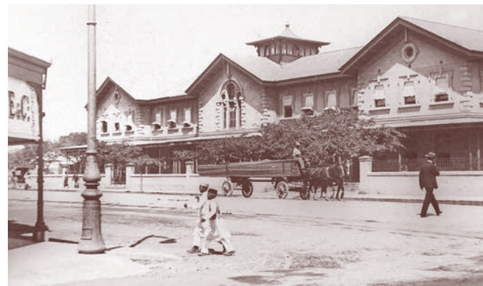
The Durban Magistrate's Court circa 1900. The Court was officially opened on 24 May 1866. On 8 April 1891 the north wing (towards Dr Pixley kaSeme Street (West St)) was added to the building providing new offices. Another court room was added to the south wing and opened on 16 November 1897. The building served as a Court House until 1912. Thereafter the Durban Municipality acquired the building. The Court House became home to the Local History Museum in 1965, and the building was declared a National Monument in 1975

Gandhi is listed in the Natal Civil Service List of 1908 as a court interpreter and translator (Gujerati) from 1896, which implies that, apart from appearing in court in connection with the cases that he had taken on, he would also have appeared in the role of interpreter or translator. The Durban Magistrate's Court building now serves as a museum, the Old Court House Museum. The museum has an interesting collection of artifacts, photographs and documents relating to Gandhi's years in South Africa.