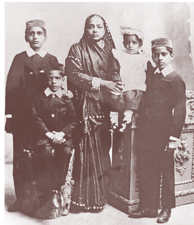
Kasturba Gandhi and children 1898. From left: Gokuldas (Gandhi's sister's son), Manilal (seated), Mrs Gandhi, Ramdas and Harilal