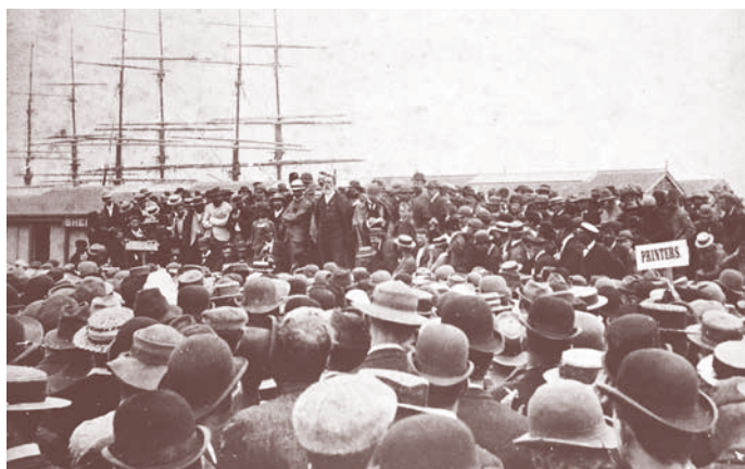
Anti-Indian demonstration being addressed by Harry Escombe at Alexandra Square on 13 January 1897