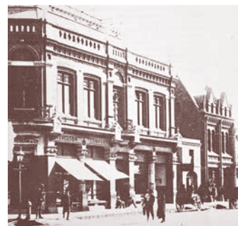
Ferguson's Corner circa 1899/ Gandhi's law office was located in this building between 1895 and 1896

[Ferguson's Corner has long been replaced by a more modern building which houses retail and commercial companies].