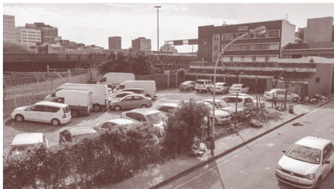
The site of Saint Aidan's Mission Hospital. All that remains are the foundations of the building which today serves as a car park. Saint Aidan's Hospital was moved to the present location in M L Sultan Road in 1935