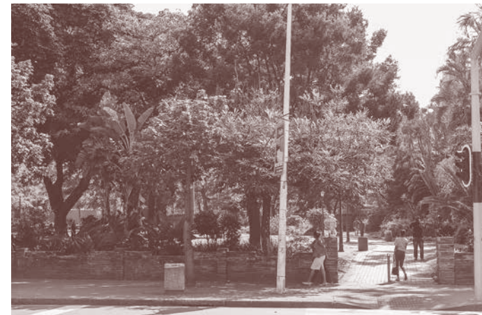
Medwood Gardens in Dr Pixley kaSeme Street (West St) now marks the location of the old Borough Police Station where Gandhi was given asylum in the upstairs Officers’ quarters following his assault