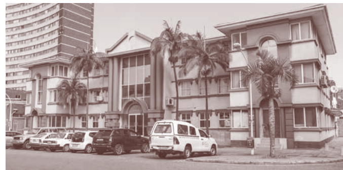
Cato Square, the vicinity where Cato's Creek ran down to the Bay