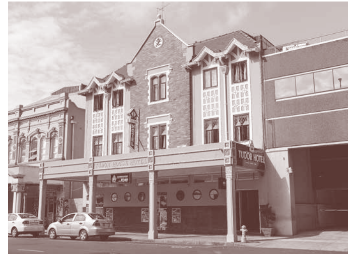
The Tudor Hotel in Dr Pixley kaSeme Street (West St) now stands in the vicinity of The Ship Hotel where Gandhi was assaulted by a white mob on 13 January 1897