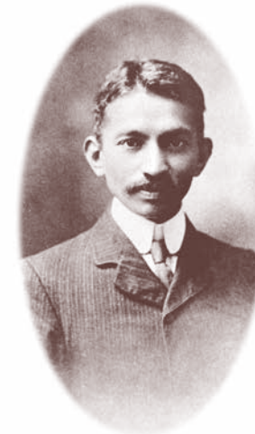
Gandhi as a young barrister in South Africa circa 1900