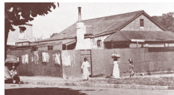
Saint Aidan's Mission Hospital at the corner of Cross Street and David Webster Street (Leopold St) was the first hospital in Durban for the health and needs of Indian people. The hospital was founded by Dr Booth whom Gandhi visited regularly to assist in caring for the sick

[Saint Aidan's hospital moved to its present location in M.L. Sultan Road, formerly Centenary Road in 1935. The old mission hospital building has been demolished, only the foundation remaining and the site is used as a parking area.]